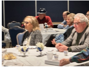
Attendees were engaged