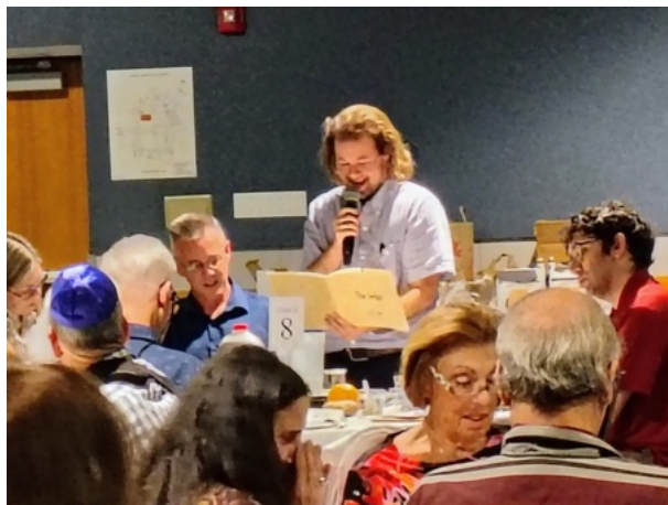
youngest person singing the Ma Nishtana.